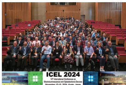
14th International Conference of Electroluminescence and Optoelectronic Devices