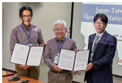
Japan-Taiwan Initiatives for Quantum Matters and Carbon Neutral