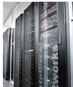
The distributed file system allowing high-speed file access is used for big data computations.