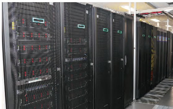
The shared memory system and the high-performance computer cluster.

The supercomputer system of ICR has been helping computational studies in broad areas of chemistry and biology, and continuously performing its special mission to provide biological database services through GenomeNet since 1992. The system is designed to serve not only experts in computational studies but also experimental researchers by supplying an array of user-friendly software and databases. In January 2020, the supercomputer system has experienced its sixth replacement. The renewed system is composed of two nodes of shared memory machines (48 TB memory and 1152 CPU cores in total) and a computer cluster (142 nodes including 18 GPU nodes, 5680 CPU cores in total) connected through a fast network (100 Gbps InfiniBand). Its storage system comprises a distributed file system (6.1 PB) and a network file system (2.3 PB). Finally, the system provides and maintains KEGG, a prominent database in life science developed in ICR since 1995.