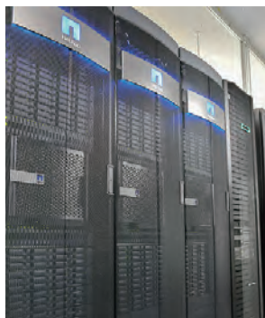
The robust network file system that stores user data and the databases of GenomeNet.