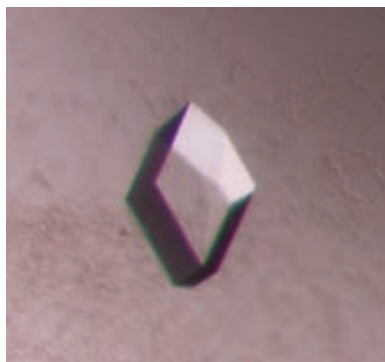
Figure 1. Crystal of maleylacetate reductase (GraC) from Rhizobium sp. strain MTP-10005. The dimensions of the crystal were approximately 0.30 × 0.20 × 0.05 mm.

Initial crystallization experiments were performed by the hanging-drop vapour-diffusion method using Crystal Screens I and II (CS I, II). The final conditions based on those of CS II#32 produced rhombohedron-shaped crystals with approximate dimensions of 0.30 × 0.20 × 0.05 mm at 293 K in 3 d using the sitting-drop vapour-diffusion method (Figure 1). Drops of 1 μl protein solution at 8 mg ml -1 (in 50 mM Tris-HCl buffer, pH 8.0) and 1 μl reservoir solution were equilibrated against 500