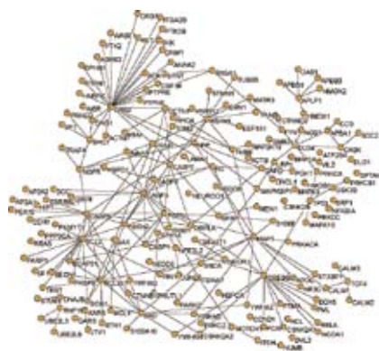
Figure 2. 174 common proteins and 202 common interactions found in the extended network of NDDs.

Kanehisa M, Hierarchical Structuring and Integration of Knowledge in Life Sciences, Integrated Database Project, MEXT.