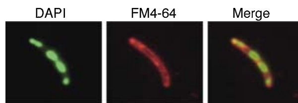
Figure 2. Fluorescence microscopic images of the EPA-less mutant of S. livingstonensis Ac10. DAPI and FM4-64 were used to stain DNA and the membrane, respectively.

Esaki N, Structure-Function Analysis of Selenium-specific Chemical Conversion System and Co-translational Insertion of Selenium into Protein, Grant-in-Aid for Scientific Research (B), 1 April 2007–31 March 2009.