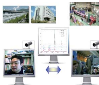
Figure 3. Image of "Collaboratory" on neutron diffraction studies. Real-time data sharing and video-meeting between KEK, Tsukuba and ICR, Uji.

S. Ishiwata et al., Phys. Rev. B 72 , 045104 (2005).