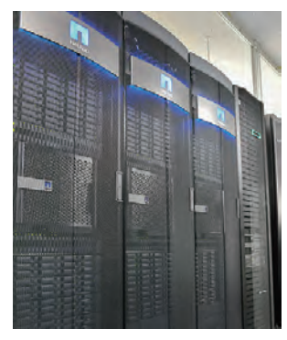
The robust network file system that stores user data and the data-bases of GenomeNet.