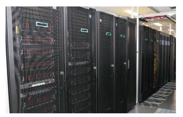
The shared memory system and the high-performance computer cluster.

The supercomputer system of ICR has been helping computational studies in broad areas of chemistry and biology, and continuously performing its special mission to provide biological database services through GenomeNet since 1992. The system is designed to serve not only experts in computational studies but also experimental researchers by supplying an array of user-friendly software and databases. In January 2020, the supercomputer system has experienced its sixth replacement. The renewed system is composed of two nodes of shared memory machines (48 TB memory and 1152 CPU cores in total) and a computer cluster (142 nodes including 18 GPU nodes, 5680 CPU cores in total) connected through a fast network (100 Gbps InfiniBand). Its storage system comprises a distributed file system (6.1 PB) and a network file system (2.3 PB). Finally, the system provides and maintains KEGG, a prominent database in life science developed in ICR since 1995.