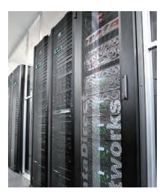
The distributed file system allowing high-speed file access is used for big data computations.