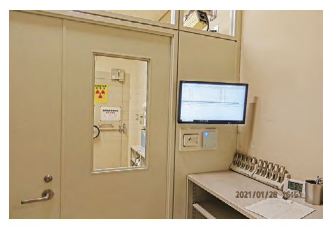
Figure 2. Renewed Entrance and Exit Management System.

This year, some maintenances and renewals of equipment of the KAKEN accelerator facility, such as an interlock system, an entrance and exit management system, a radiation safety system, and accelerator control systems have been done aiming to restart the facility from the next fiscal year because those systems were severely deteriorated by aging and some devices were broken. Figure 2 shows the renewed entrance and exit management system which controls the electronic lock and records when and who enters the controlled area by using a QR code. These works are supported by the International Joint Usage/Research Center and the Kyoto University President's Discretionary Fund.