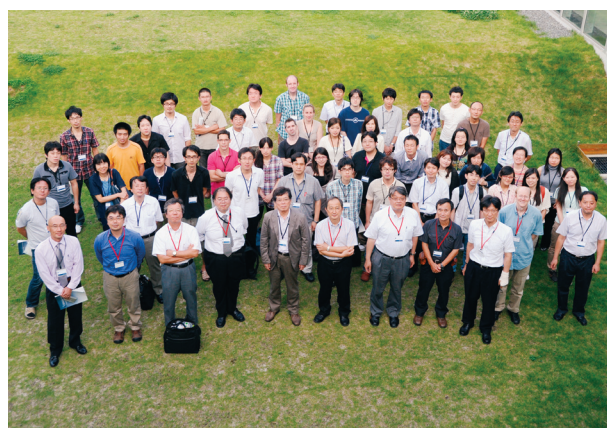
Participants of 10 Year Anniversary Symposium