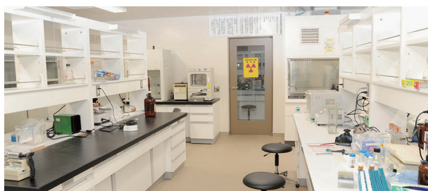
Uji Radioisotope Laboratory

centralization of the radioisotope laboratories, redesigning of the Uji library, and introduction of new common spaces in the campus (such as a relaxation room for women, shower booths, and so on). Furthermore, on the occasion of the retrofit, ICR spent its own budget to increase the laboratory area and upgrade the research facilities. In particular, new research laboratories equipped with advanced instruments, e.g. , 800 MHz NMR, have been assigned as open laboratories of the ICR Joint Usage/Research Center (ICR-JURC) approved by MEXT as of 2010, thereby serving as a strong base for enhanced collaboration between ICR and other universities/research institutes as well as among the ICR faculty members. Thus, the effort of ICR for the seismic retrofit was rewarded by many infrastructure improvements to the facilities at ICR.