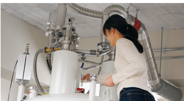
800 MHz NMR