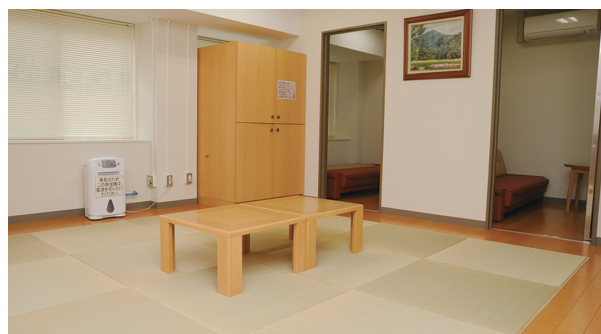
Relaxation Room for Women