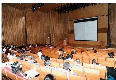
Symposium in Kihada Hall, Uji Obaku Plaza