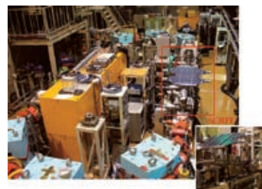
Figure 3. An overall view of an electron storage ring, KSR, where the SCRIT is installed.

With the use of an electron storage ring, KSR, the studies of the structure of nucleus trapped into an ion trap: SCRIT (Self-Confining Radioactive Isotope Ion Target) set in a straight section of KSR as shown in Figure. 3 has been performed in these a few years by collaboration with a group from RIKEN. Recently the principle of such a scheme to investigate the structure of the nucleus detecting the scattered particles by an electron-nucleus scattering has been successfully demonstrated for stable ions as ^{133}Cs , although the final aim of such a scheme is to be applied for unstable nuclei [2].