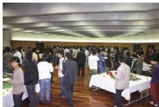
The banquet of Global COE Joint Kick-off Symposium