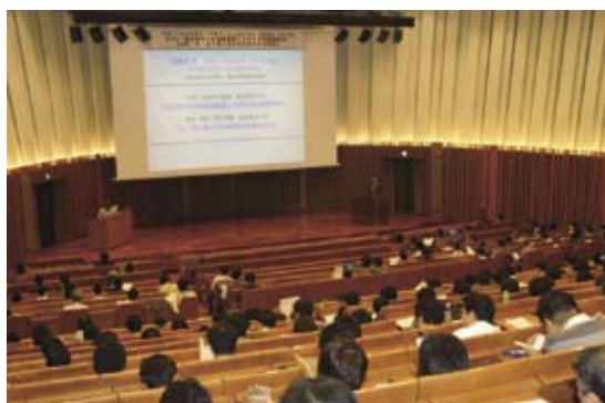
Global COE Joint Kick-off Symposium at FUNAI TETSURO Memorial Hall, Katsura Campus on 23 October 2007