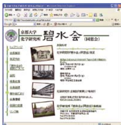
HEKISUIKAI website ( http://www.kuicr.kyoto-u.ac.jp/hekisuiikai/ )

Take a look at website of ICR alumni association ( http://www.kuicr.kyoto-u.ac.jp/hekisuiikai/ ) to sign up for the membership. As a member of the alumni association, you will receive updated information about ICR. We would like to invite all the members to our annual summer beer party “RYOINKAI.”