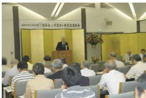
The general meeting for inauguration of ICR alumni association