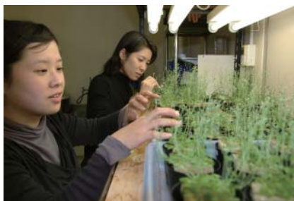
Figure 1. Arabidopsis cultivars.

Cytokinins are a class of phytohormones that induce a variety of physiological and developmental events, including cell division. These responses to cytokinins in Arabidopsis thaliana (Fig. 1) are triggered through the perception of cytokinin by the sensor histidine kinase CRE1. A cre1 mutation leads to defect of vascular development, the degree of which depends on each mutant allele. Among those, the wol allele show severe inhibition of root growth accompanied by missing phloem, and by frequent generation of short adventitious roots in which the reduced numbers of vascular cells are included [1].